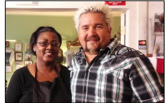
Air Episode 17 - Timeless Traditions

As Featured On Diners, Drive-Ins & Dives